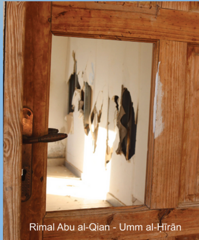
Rimal Abu al-Qian - Umm al-Hīrān

“Sensitive and powerful documentation, which deals, among other things, with memory and its erasure. The filmmakers immortalize their home and the process of its destruction, and the longing for a home while it is being crushed. In the act of documenting, the creator presents the story of the Bedouin society, together with their stories, of their home, and their children. In a rare and unique way, the film manages to combine images of pain and destruction, with a poetic language that is full of beauty and even inspires hope”.