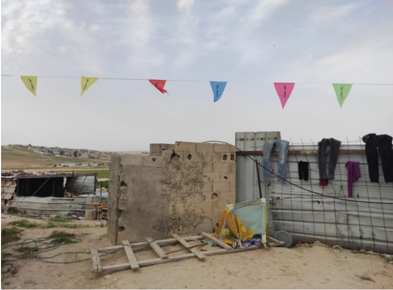
Photo: unrecognized village of al-Fur‘ah, March 2021