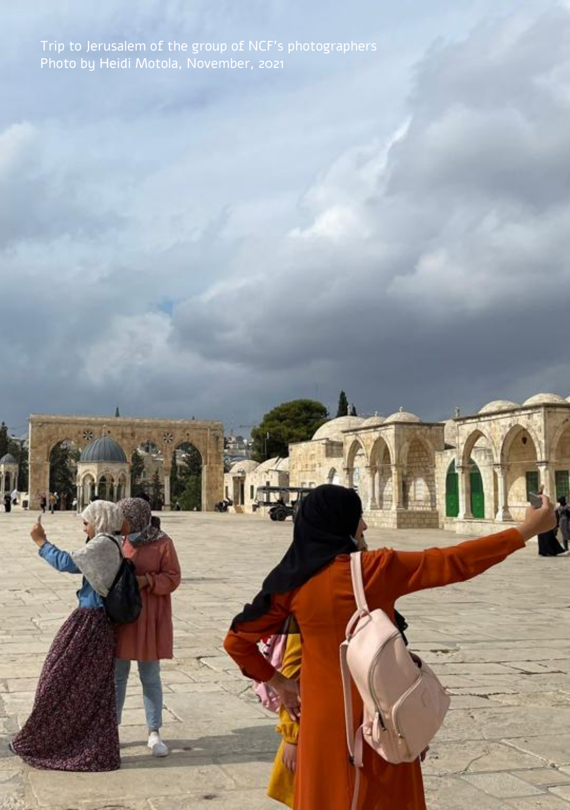
Trip to Jerusalem of the group of NCF's photographers, November, 2021