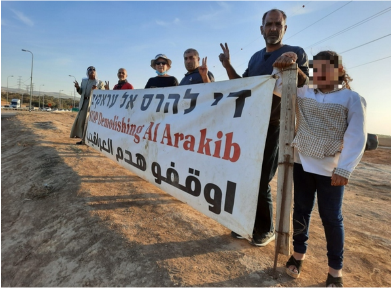
Photo: Weekly protest against demolition and eviction of the unrecognized village of al-ʿArāgīb, November 2021.