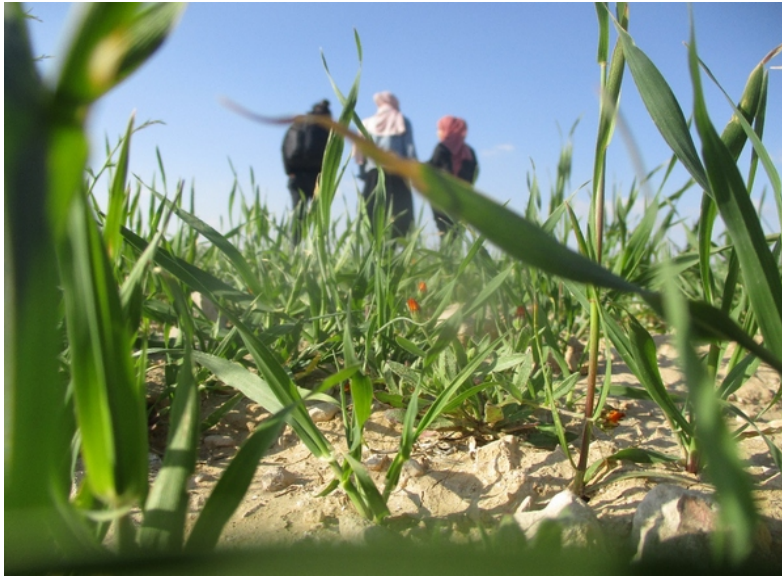
Photos by Sujud al Amour, from the unrecognized village of as-Sirrah, February, 2021

of information about the pandemic, vaccinations, and prevention measures in Arabic. 64