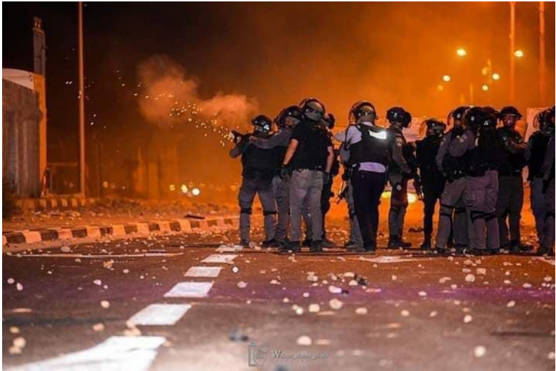
Rahaṭ and Šgīb as-Salām, May 2021