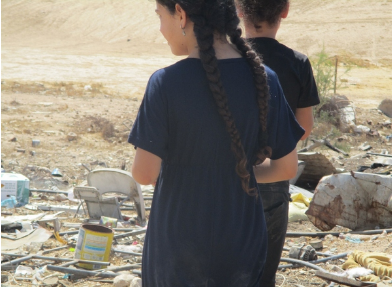
at a kids' workshop, unrecognized village of Umm al-Ḥīrān, June 2021