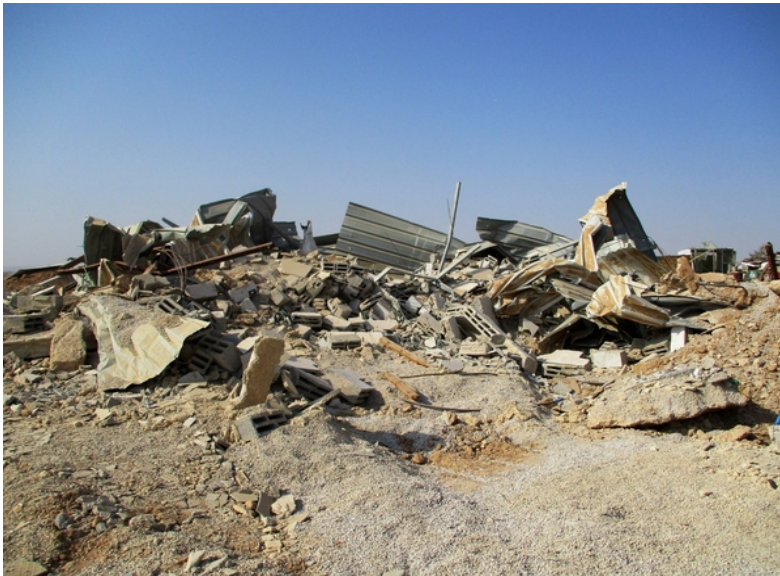
az-Zarnūg, 2020.

demolition orders, usually because they live in unrecognized villages or neighborhoods and are not granted building permits. The members of the community are waging a protracted struggle over land ownership, which the State continues to deny. 42