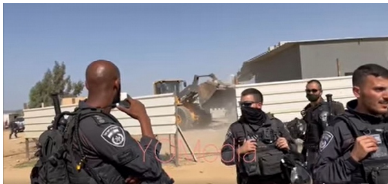
Snapshot of video filmed by Okbi Yasser, demolitions in the recognized village of Umm Batīn, October, 2021

Bedouin citizens particularly vulnerable to contracting the virus.