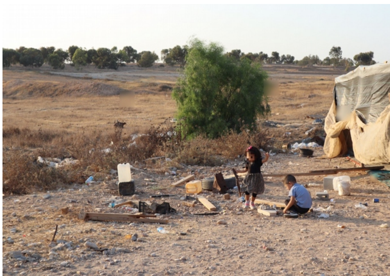
Unrecognized village of al- ʿ Arāgīb 24.7.21. Launching of the village's art center, children playing on the side.

Egypt, the Gaza Strip, and the Sinai Peninsula, leaving behind a population of 11,000. 6 At that time, the State of Israel began evicting Bedouin communities from their historical villages, a process which continues to this day. From the early 1950s until 1966, the State of Israel concentrated the Bedouins in the Negev-Naqab in a closed area called the Siyāj (in Arabic: fence), under military rule. During this period, the State displaced entire villages from the western and northern Negev-Naqab into the Siyāj area.