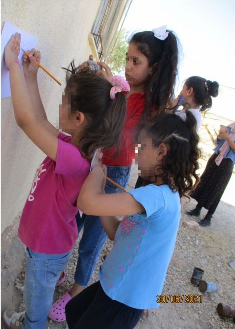
at a kids' workshop, unrecognized village of Umm al-Ḥīrān, June 2021