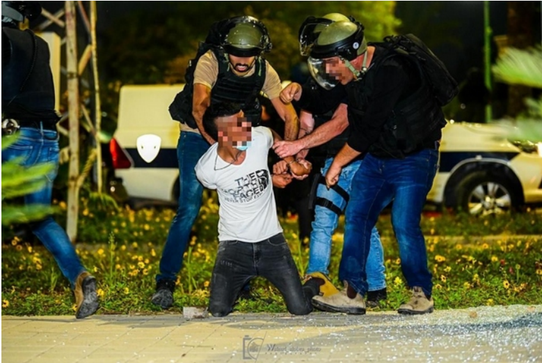
Šgīb as-Salām, May 2021

On May 12th, a protest in Šgīb as-Salām was violently suppressed by the police. On May 13th, it was confirmed that police held more than one-hundred detainees. Some of the detainees were investigated by the Israeli Security Forces (Shin Bet or Shabak). 25