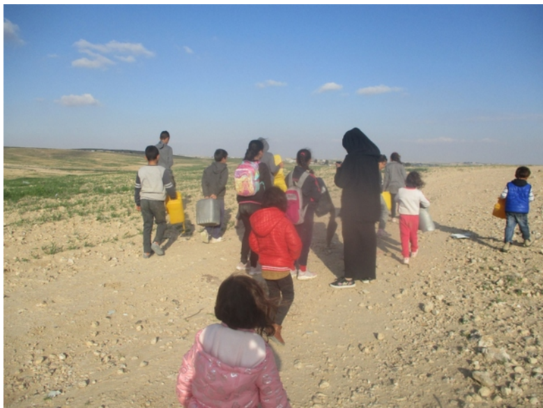
from the unrecognized village of as-Sirrah, June, 2021

Government to approve the plan. 68 According to the position of the Ministry of Environmental Protection, the policy of phosphate mining in a period of climatic and ecological crisis should be re-examined. 69