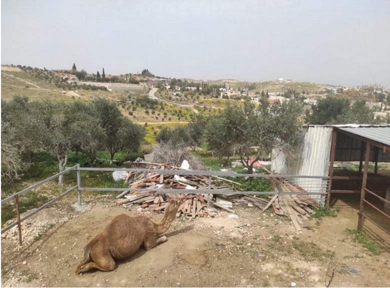
Bedouin township of al-Lagiyyih, March, 2021

Throughout 2020 and 2021, enforcement authorities continued to distribute demolition warrants, carry out demolitions, interrogate livestock farmers, and issue fines to herders (mainly for the purpose of harassment). 48 These enforcement measures cause extreme duress and lead to people demolishing their own structures in order to avoid continued harassment. During 2020, self-demolitions represented 94% of all structures demolished. 49 The trauma