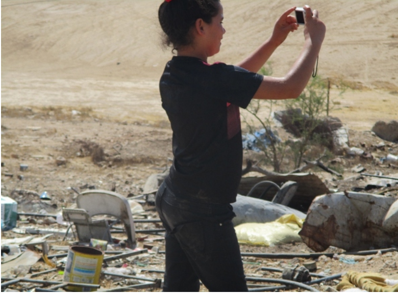
from the unrecognized village of Umm al-Ḥīrān, during NCF's kids workshop, August, 2021