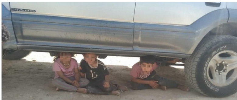
Children from an unrecognized village seeking protection under a car during wartime, May, 2021. The photographer is unknown

escalation, rockets fell in two Bedouin villages, Abu Grīnāt and Awajān, injuring residents. 34 The residents received no warning of the impending attack. Later, three sirens went off in al-Lagiyyih, two in Tal as-Saba‘ and one in as-Sayyid and Mūlada’h. Two rockets fell in the unrecognized village of Wādi an-Na‘am. Most of the homes in the seven townships do not have safe rooms and the public shelters are insufficient for the needs of the growing population. 35