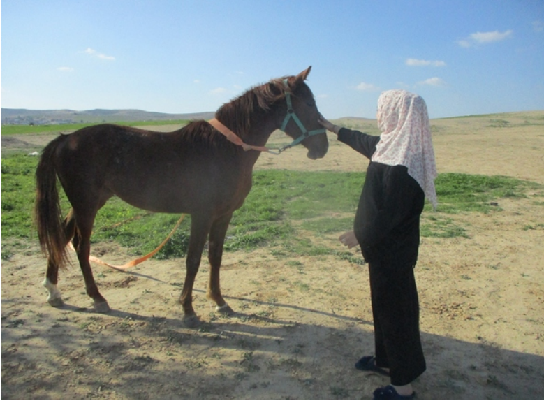
from the unrecognized village of as-Sirrah, February, 2021