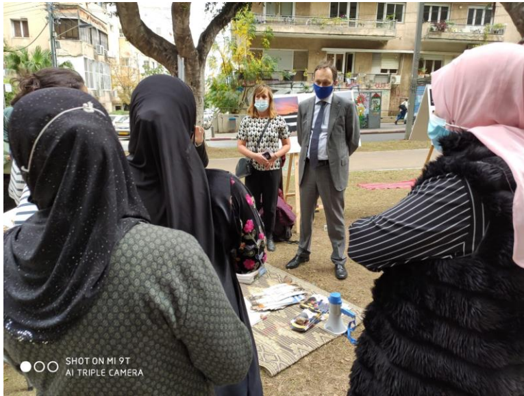
Exhibition in Tel Aviv hosted by the EU Ambassador and other diplomats

One of the main venues for NCF to promote a shared society is enabling spaces of dialogue between the Bedouin communities, the international community and the civil society.