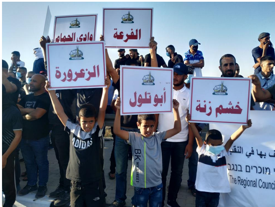
Demonstration az-Zarnūg- 25.6.2020

In 2020, we worked closely with other organizations, including Adalah – The Legal Center for Arab Minority Rights in Israel and the Human Rights Defenders Fund on international advocacy; Shatil, Bimkom, RCUV (the Regional Council for the Unrecognized Villages), Zazim, Sikkuy, Kedmah – promoting equality in education and society in Israel, The Mizrahi Democratic Rainbow – New Discourse, ACRI – The Association for Civil Rights, The Minerva Centre, ADVA Centre, Sidreh, Jahalin Solidarity Group and more, on local activism and advocacy.