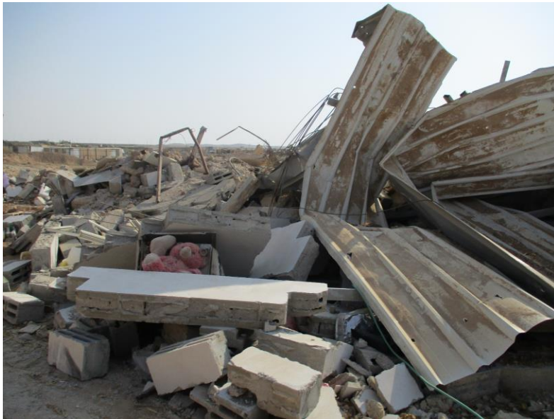
Demolition in az-Zarnūg. az-Zarnūg, 15.09.2020

On March 19, NCF along with 22 civil society organizations, sent an urgent letter to Mr. Avichai Mandelblit, Attorney General, demanding immediate action. The organizations warned that demolition of homes and crops will have a devastating economic impact on the Bedouin people, one of Israel's most impoverished communities. Although the Attorney General's instruction to stop demolitions in Bedouin localities as well as reducing distribution of demolition warrants and Police presence during the Pandemic, the number of demolitions during 2020 reached its highest number historically: 258 6 demolition of