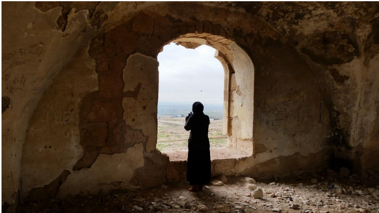
Research work in Khirbat Kseifeh, January 2016