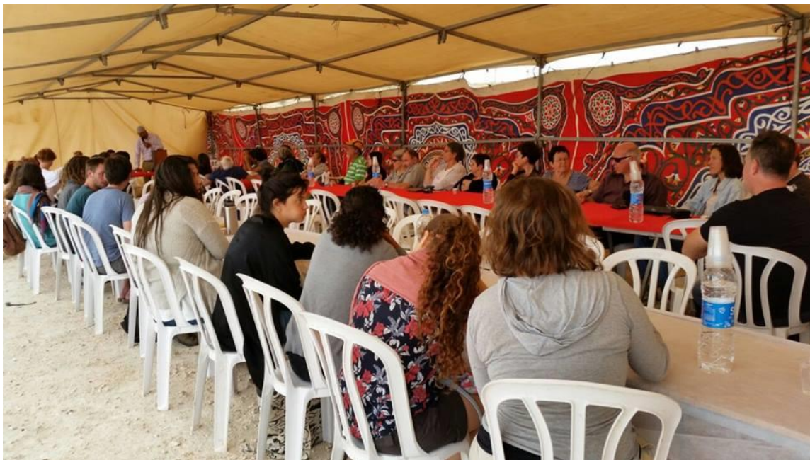
Solidarity Visit in Hura, May 2016