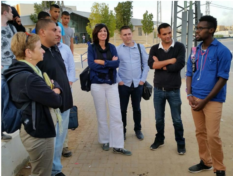
Diplomat's tour visit Šgīb as-Salām and speak to resident. November 2016