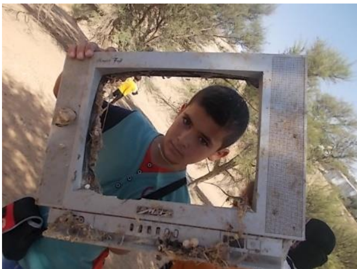
Children's photography workshop in Umm al-Ḥīrān, August 2016.