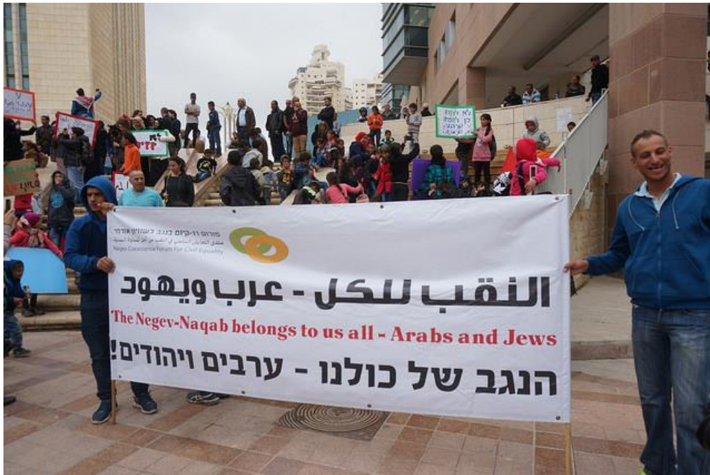
Demonstration against the uprooting of Umm al-Ḥīrān and 'Atir. March 2016