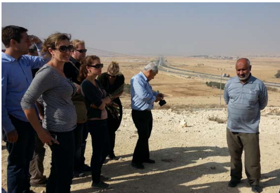
Field trip for Diplomats appointed in Israel, November 2013

In 2013 these diplomats' tours were attended by staff from the French, Holland, Romanian, German, EU mission, Swedish, American and British embassies. Visits to unrecognized villages for diplomats have been instrumental in ensuring that the issue of discrimination against the Bedouin citizens of Israel is understood and witnessed by foreign country representatives.