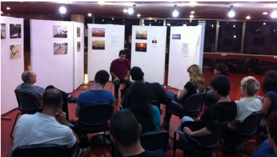
Lecture about the Negev during NCF's photo-exhibition at Tel Aviv University, October 2013