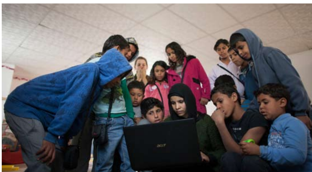
Photography workshop for the children of the Bedouin unrecognized village of Khasham Zaneh, January 2013

The photographs taken during the workshop have been presented at a number of photo-exhibitions, in order to raise awareness of the situation in the unrecognized Bedouin villages in the Negev.