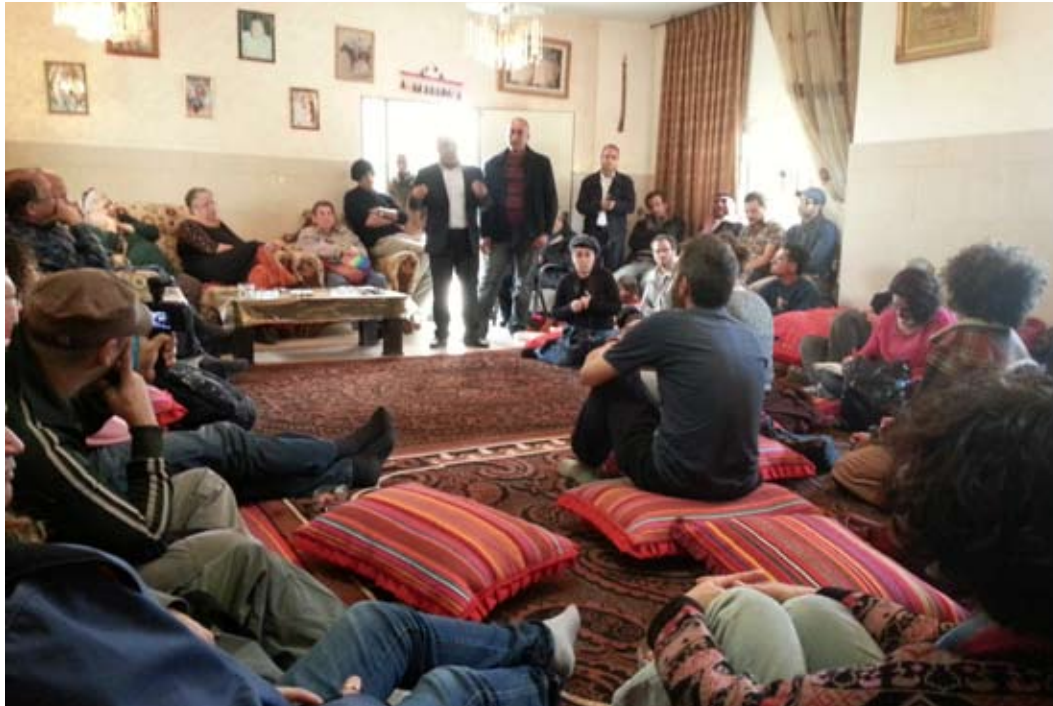
Solidarity visit in the village of A-Sayed to families of the "Day of Rage" detainees, December 2013