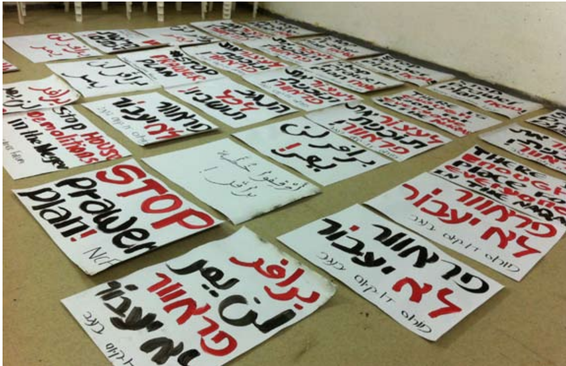
Signs for Demonstration against Prayer Plan on Prayer Plan, Summer of 2013

NCF also organized two protests outside the Be'er Sheva District Court in December.