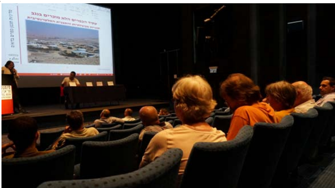
Panel about the situation in the Negev during NCF's film festival at the Tel Aviv Cinematheque, November 2013

On November 6th and November 7th, NCF held two days of documentary films and discussions about the Naqab at the Tel Aviv Cinematheque. The event was planned in this alternative venue to attract a diverse audience and was successfully executed. It attracted some 300 people, many of whom joined NCF's mailing list, explored and took home the available literature about the negev and participated in the organized panel-discussions.