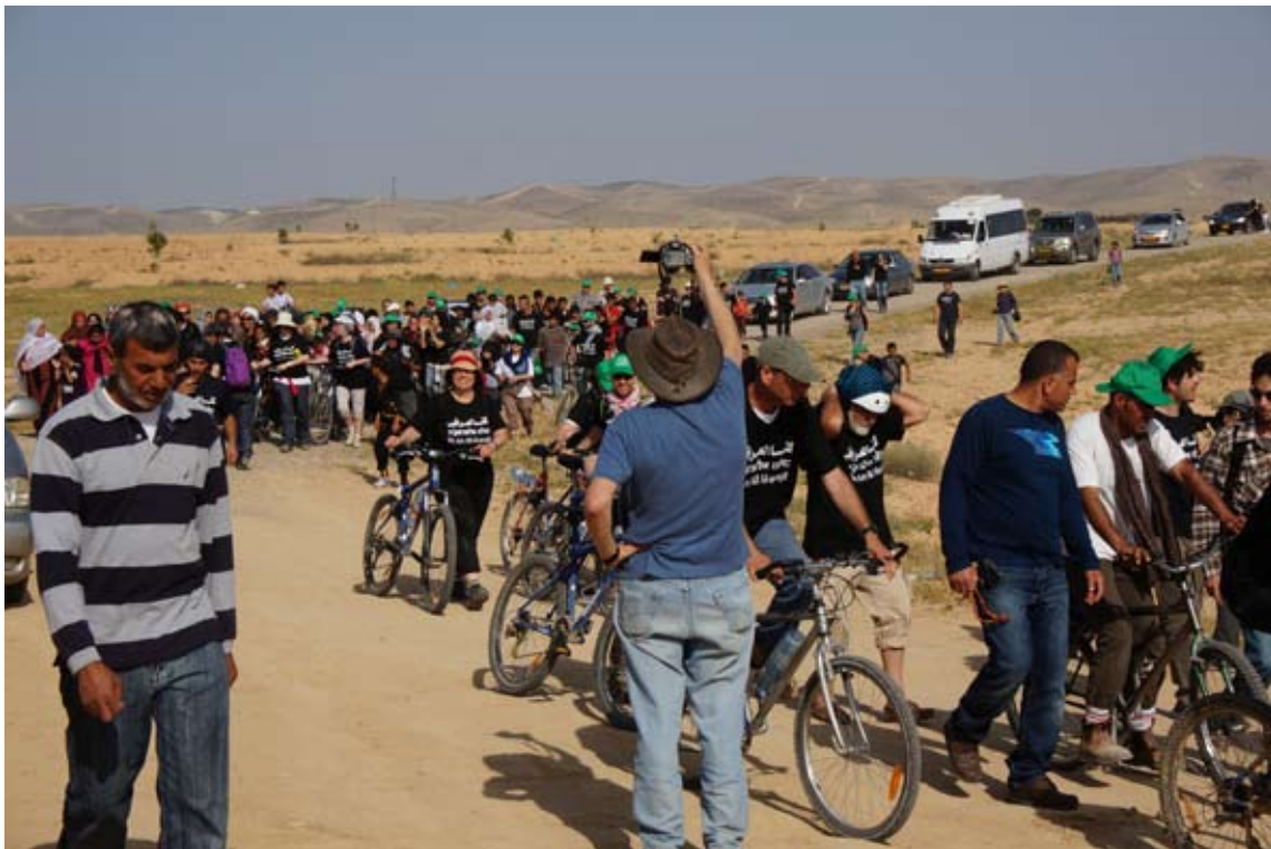
Dozens of participants in the "Cycling for Recognition" 5 days cycling tour among the Bedouin villages in the Negev arrive at the final event in the village of Al-Arakib, April 2013

In 2013 NCF held six discussions circles which attracted 101 participants. In this activity our Jewish and Bedouin staff is invited into the homes of Jewish Israelis to discuss democracy and human rights in the Negev. The discussions tackle difficult subjects such as recognition of indigenous land rights and highlight the hurdles that the Bedouin face in accessing their rights despite their full citizenship. The group discussions are aimed at diversifying our audience and appeal to Jewish Israelis who are not necessarily politically active or familiar with the Negev. In 2013 these were held in locations in Jerusalem and Be'er Sheva.