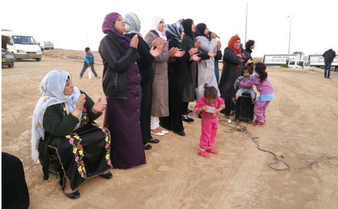
The Al-Arakib weekly protest against the ongoing demolitions of the village at Lehavim junction