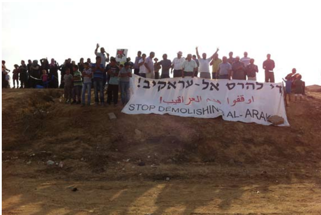
NCF's placards for the protest against "Praver Plan", August 2013