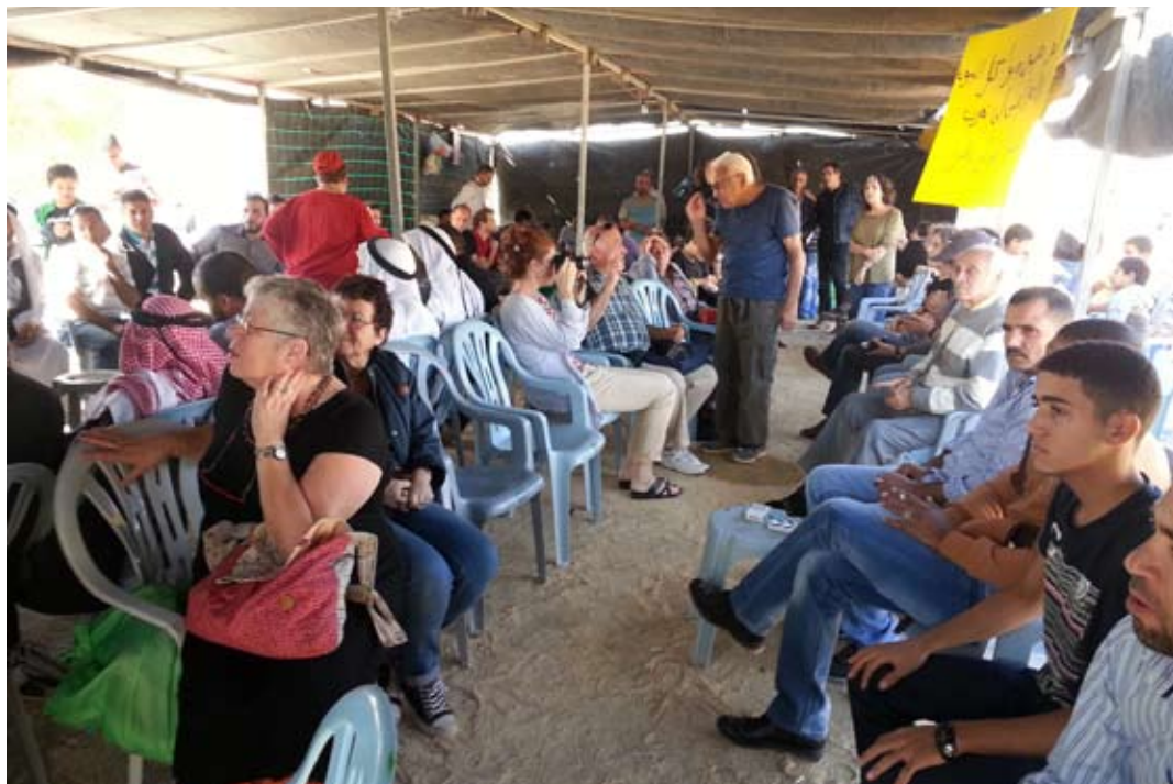
Visit at the "Freedom Tent" that was built outside Rahat police station following the detention of Sheikh Sayyah A-Turi, November 2013