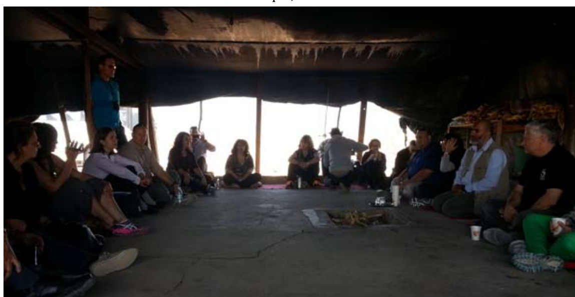
Field trip with the group "Honest Reporting Australia" in the Bedouin unrecognized village of Wadi A-Na'am, November 2013